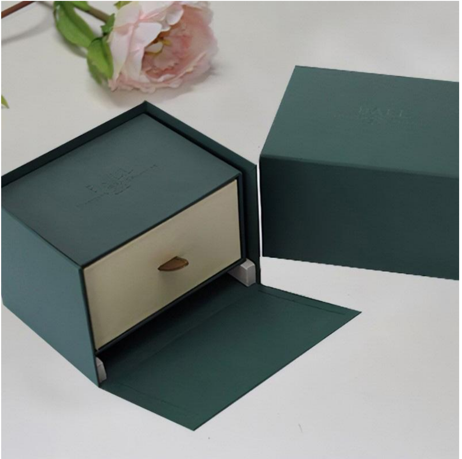
Sinst Cardboard Handmade Gift Box for Knife Process